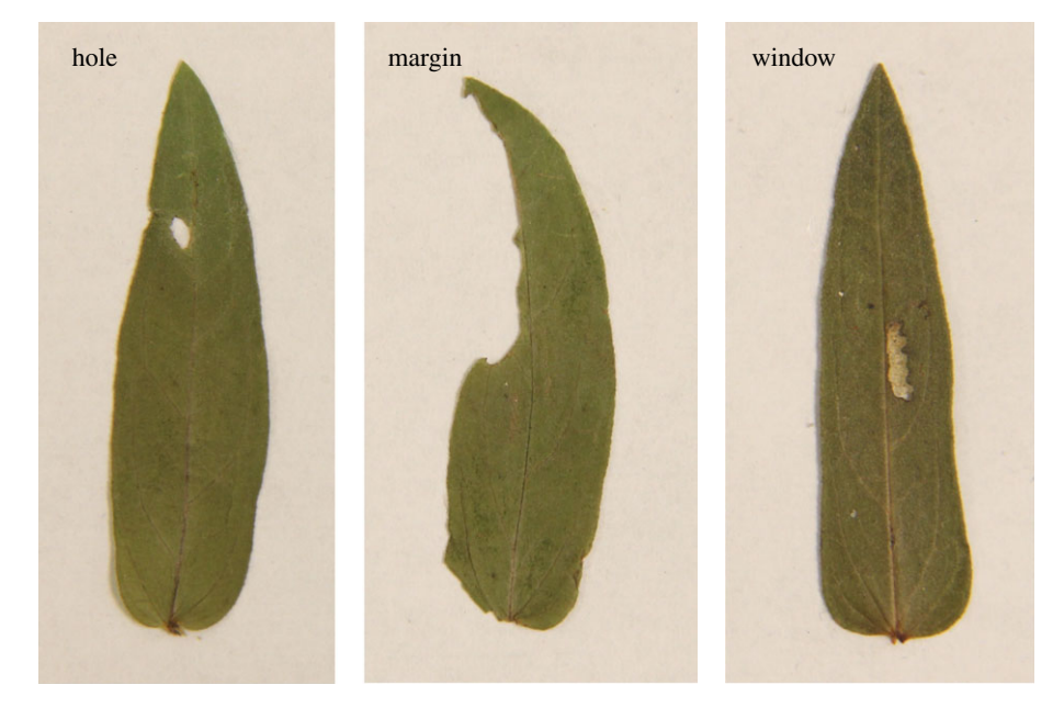
Figure 2. Different types of damage found on purple loosestrife herbarium specimens (Lythrum salicaria) in Quebec (Canada): hole, margin or window.